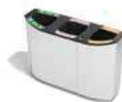
Recycling labels available.