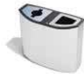
Design guides the user to recycle different waste fractions.