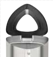
Hinged lid equipped with triangular lock, pivoting bag frame.