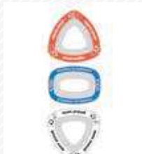
Recycling labels available.