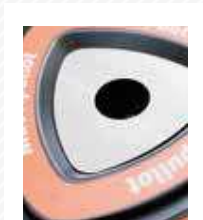
Design guides the user to recycle different waste fractions.